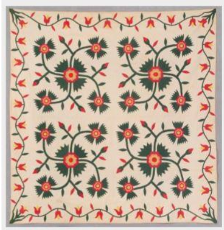
Tulip Cross Applique